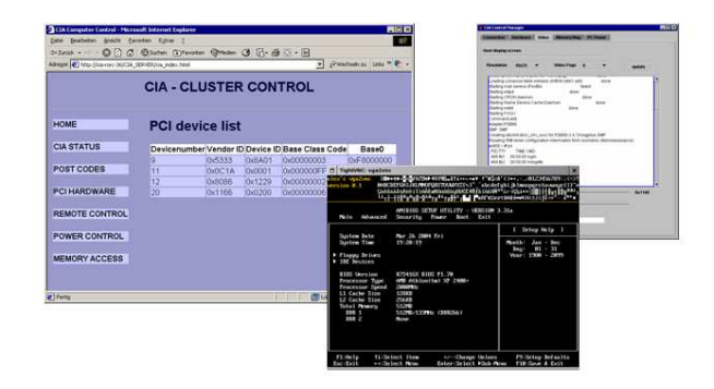
Figure 3: CIA Control Application

Figure 3 shows the CIA card control applications. The card can be commanded by a web browser. PCI scans can be initiated, which provide a list of the devices plugged in the PCI bus. Also, receiving POST codes and accessing the main memory is facilitated by the web interface. The picture in the middle of figure 3 shows a VNC viewer, which displays the BIOS settings. The picture to the right in figure 3 is a JAVA application, which possesses the same features such as the web interface, but a couple of CIA cards can also be controlled at the same time. Every control application can be done by any computer that is connected to the CIA network.